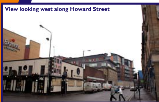
View looking west along Howard Street