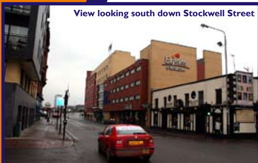
View looking south down Stockwell Street

Fax: 0141 229 6025 Web: www.alsurveyors.co.uk