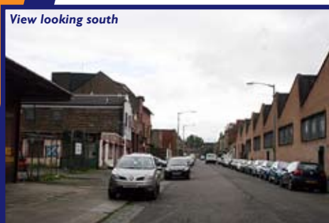
View looking south