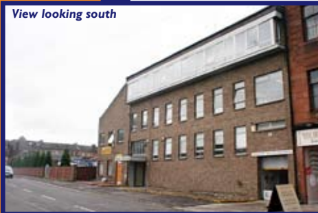
View looking south

From measurements taken on-site and in accordance with the RICS Code of Measuring Practice (Sixth Edition), we calculate the subjects extend as follows: